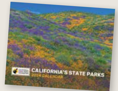
CALIFORNIA STATE PARKS FOUNDATION CALENDAR