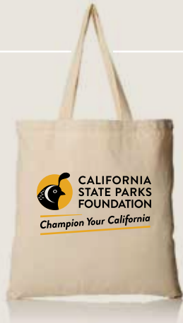
REUSABLE CALIFORNIA STATE PARKS FOUNDATION TOTE BAG

Join with a contribution of $25 or more per year and you'll receive all the benefits of membership: