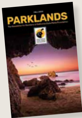
PARKLANDS NEWSLETTER AND E-NEWS