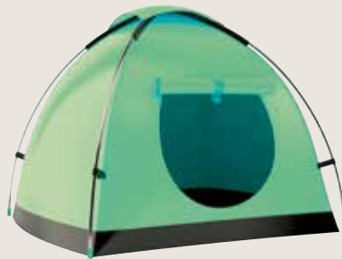
10% CAMPING DISCOUNT AT MOST STATE PARKS