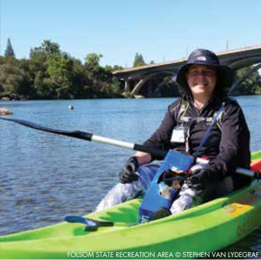
FOLSOM STATE RECREATION AREA