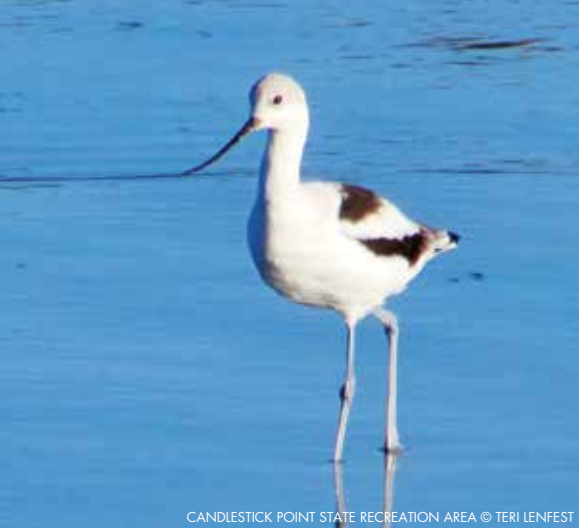
CANDLESTICK POINT STATE RECREATION AREA