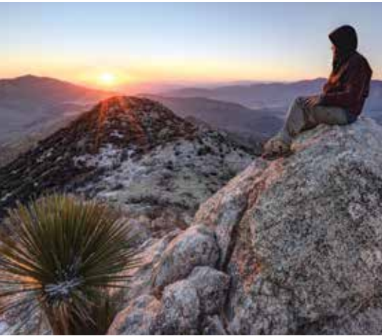
ANZA-BORREGO DESERT STATE PARK

Thank you, again, for your support—we are deeply grateful for your partnership in keeping our state parks vibrant and healthy for all to enjoy, today and in the future.