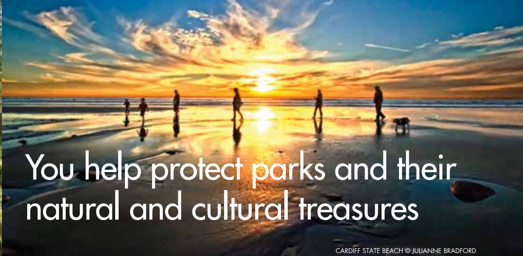
CARDIFF STATE BEACH