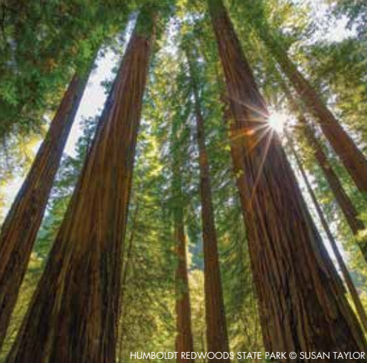
HUMBOLDT REDWOODS STATE PARK