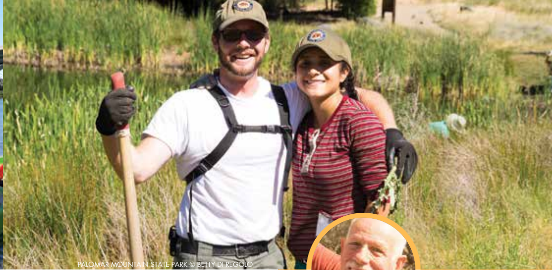
PALOMAR MOUNTAIN STATE PARK