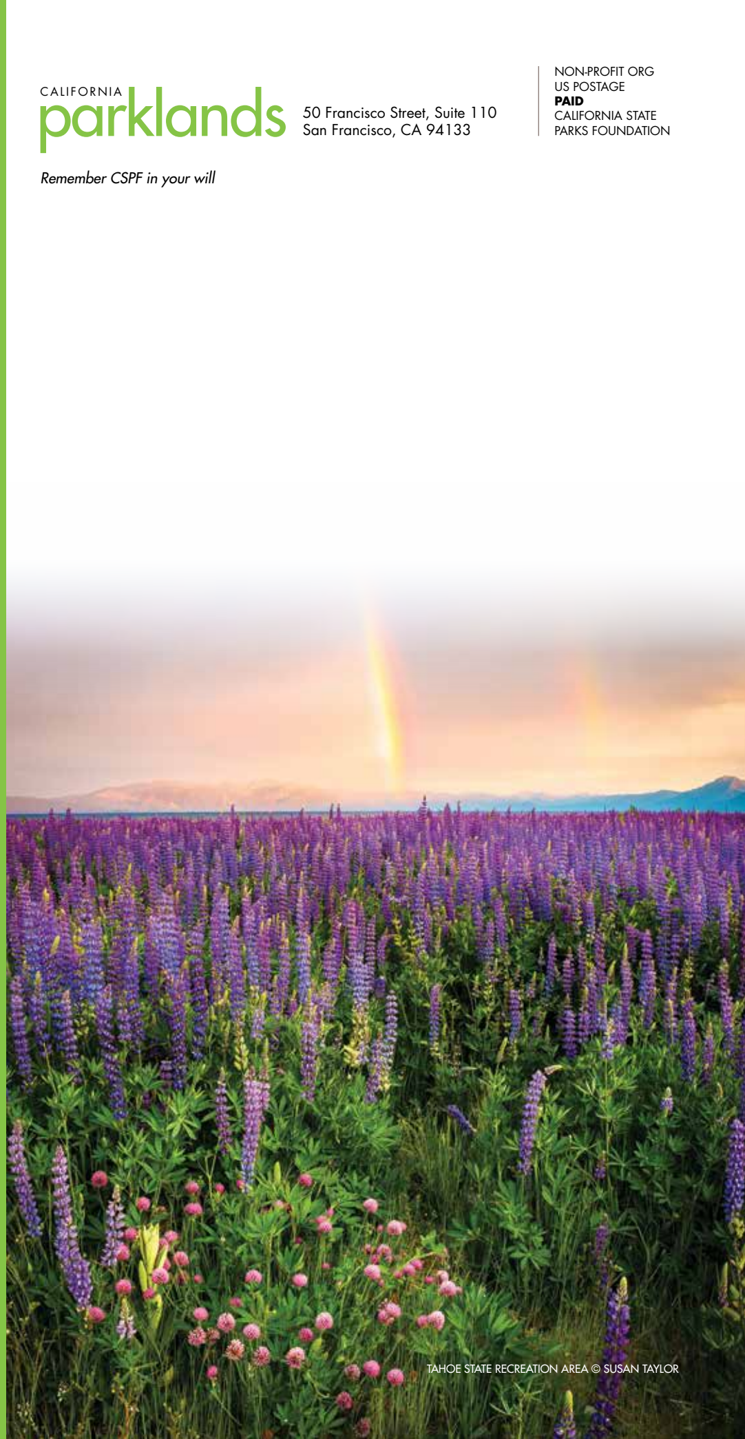
TAHOE STATE RECREATION AREA

Printed on 30% post-consumer recycled elemental processed chlorine-free paper. By using this recycled paper we are saving 14 trees, 12 million BTUs of energy, 12,676 pounds greenhouse gases, 13,529 gallons of water, and 1,384 pounds of solid waste.